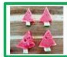
Watermelon Christmas Trees