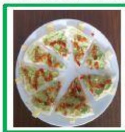
Christmas Tree Avocado Pita Bread

Involve your students in creating colourful, fun and healthy foods for your Christmas or end of year class party. Some ideas are below or create your own.