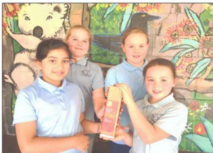
Students proudly holding their award

Wiangaree - The Risk - Rukenvale - Barkers Vale - Afterlee - Collins Creek Public Schools