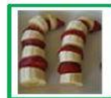
Banana/strawberry Candy Canes